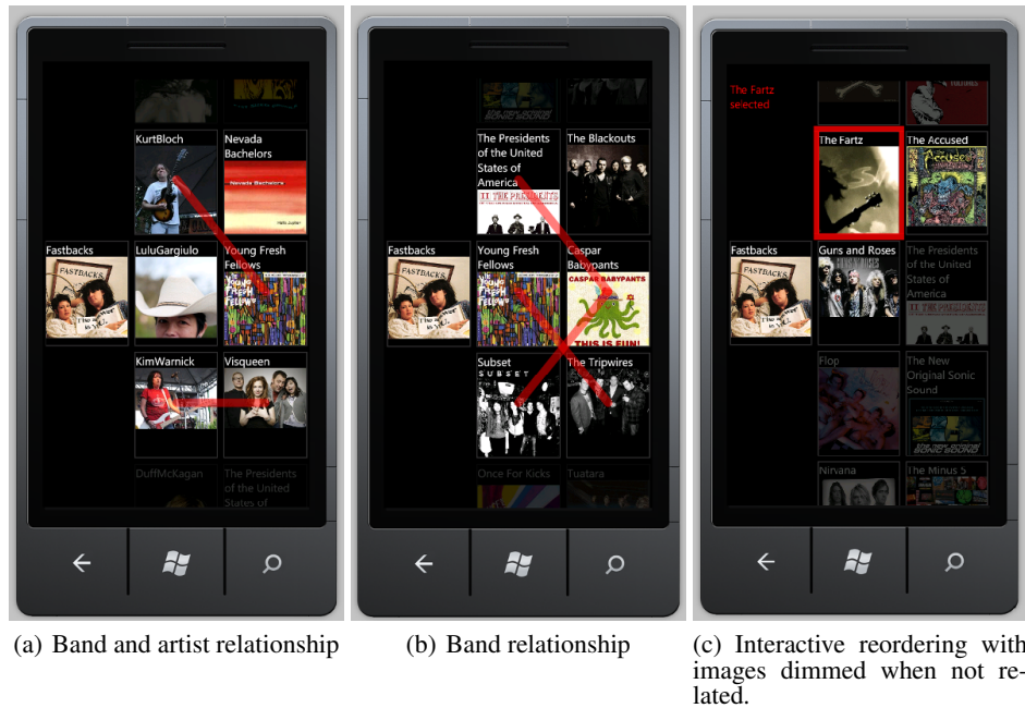
Figure 3. Applying GraphTiles to Seattle's music band data.

taining a large cross section of its database (approximately 3GB in size). We then randomly selected 60 nodes within the IMDb graph describing well-known actors (supporting PMP queries), and 60 nodes describing well-known movies (supporting MPM queries). We then sampled the two-link neighborhood around each actor (PMP) node by adding the top movies linked to it as indicated by IMDb's own API call; and then for each of those top movies, adding its top actors, again as indicated by IMDb's API call. We created two-link neighborhoods around movie (MPM) nodes similarly. The number of top movies returned by IMDb's API was generally much lower than the number of top actors.