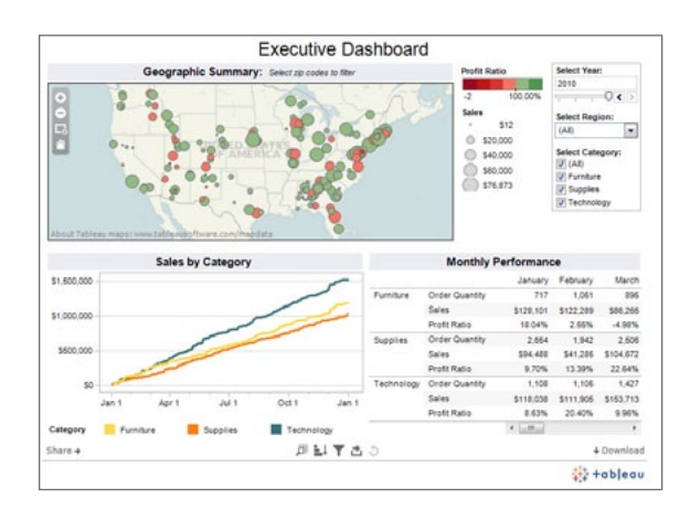
Figure 2: Dashboards mean you don't settle for one piece of the puzzle.

Adding dashboards to your analysis toolkit equips you to consider all relevant factors for your decisions in one place. Forget about development queues or tenuous Excel features and put the power of creating dynamic dashboards in your own hands.