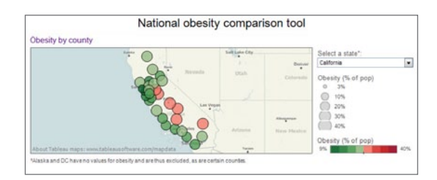
Figure 3: Include maps in a snap.

Tableau instantly recognizes geographical data. Whether your data includes a list of country names or postal codes in France you'll be creating maps in a matter of clicks.